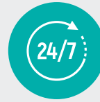
24/7 Technical Support