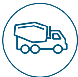
Construction and Job Site Management