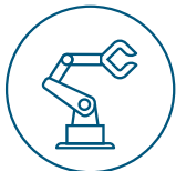
HVAC and Industrial Equipment Monitoring

Industrial IoT applications in remote, harsh and demanding environments require solutions designed specifically to meet the challenges of these environments. Broadband Access, an AirVantage® Managed Solution, delivers fully managed, end-to-end wireless broadband solutions for Industrial applications, with flexibility for your specific requirements. The solution provides critical connectivity suitable for permanent, temporary, primary and back-up needs.