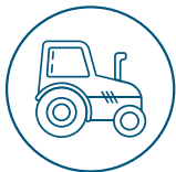
Agriculture, Farming and Food Production